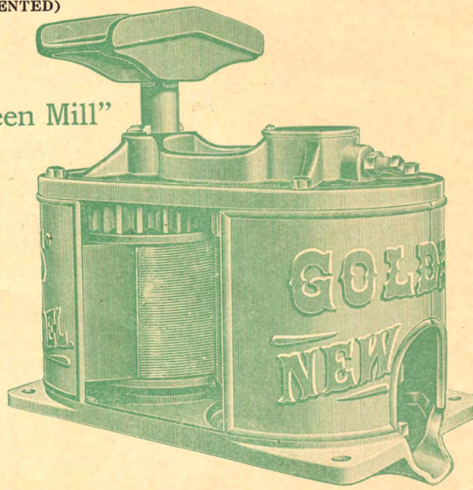
SHOWING STEEL SCRAPER AND DISCHARGE SPOUT

These Mills have same general design and patented features of our STANDARD Two-Roller Mills, but in addition they are HEAVIER and STRONGER throughout.